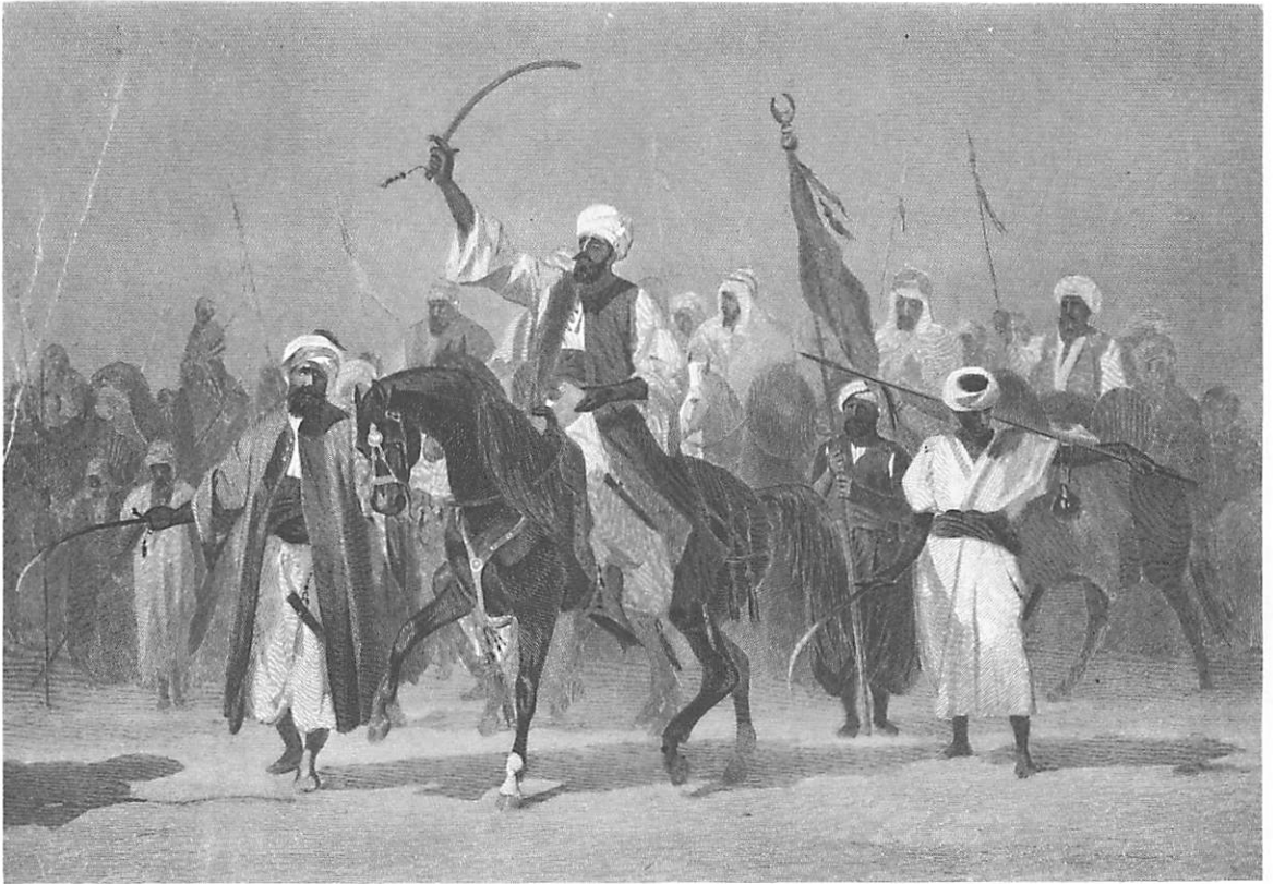
Moslem crusaders under Muhammad conquer in Allah's name.

Africa. The new religion, of course, continued to spread, in the intervening centuries, far beyond the borders of the original Moslem conquests. Currently, it has tens of millions of adherents in Africa and Central Asia, and even more in Pakistan and northern India, and in Indonesia. In Indonesia, the new faith has been a unifying factor. In the Indian subcontinent, however, the conflict between Moslems and Hindus is still a major obstacle to unity.